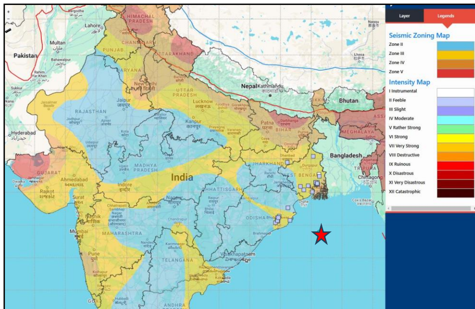
Figure 3: Felt responses (squares) of the 25 th February 2025 earthquake M 5.1 (circle) from different users reported on www.seismo.gov.in and BhooKamp mobile app. 28 responses were received within three hours from the time of occurrence of an earthquake.